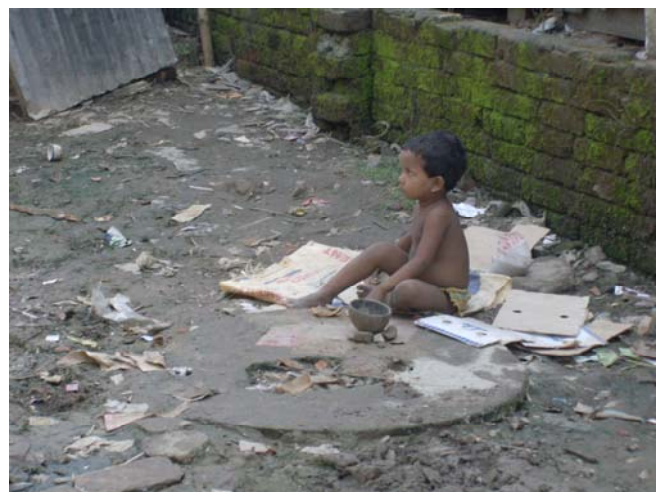
Figure 03: Scattered disposal of wastes

According to the households in study area, there is no fixed place for waste disposal. Generally wastes are disposed wherever they live like on the ground or above the water body. Therefore, scattered wastes are found visible in open place. It indicates that adequate facilities of waste disposal as well as collection are almost non-existent in slum area. From the sample data, it has been found that a large number of households (57%) dispose wastes into the water body, while 42% of households dispose on the ground, mainly on the street. Though, only 1% of households have been found to dispose wastes in dustbin. Exposure to such dirty environment is very risky for children as they spend most of their time playing outside.