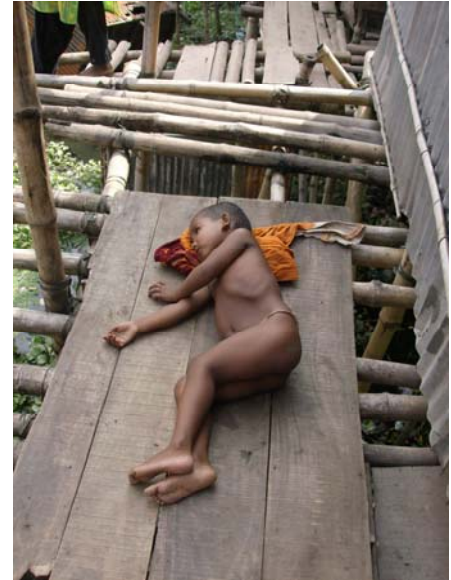
Figure 04: diarrhoea patient

Almost half of total 856 children are reported sick due to different types of water-borne diseases. 67% of affected children have been reported as suffering from diarrhea. The higher prevalence of disease among children reveals inadequate education or lack of consciousness among parents to give proper care to the children. Most of the time mothers are busy with household works; therefore children are not given enough care by them. Also unhealthy environment and mother's lack of knowledge about hygiene and dietary practice make children more vulnerable. Even though parents have some kind of primary education but lack of affordability to consume healthy food indicates poor dietary practice among children living in slums. It is said that nutritious food prevents chronic disease as it helps children to recover disease quickly like diarrhea. But majority of households can not afford healthy food items like protein food, not even in weekly basis.