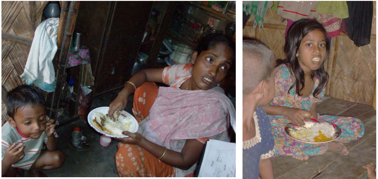
Figure 02: Lack of diversity in food item